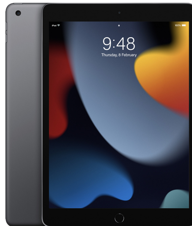
IPAD 10.2 (7TH, 8TH & 9TH GEN)

Can't find your tablet model above? Contact us to find a solution for you.